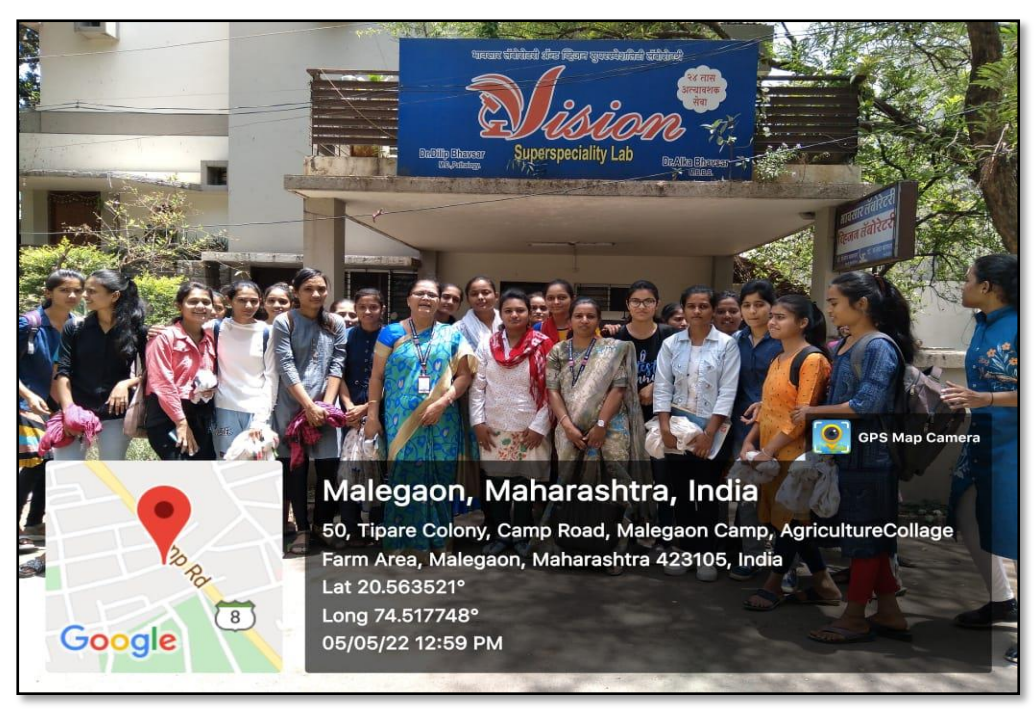
Students are Visited to Bhavsar Pathology Laboratory